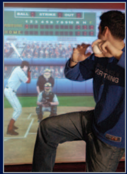
Pitch against lifesize batters into a lifesize strikezone and be part of the action! Strike 'em out with your hardest pitch and see how fast you can really pitch a baseball!

Visual Sports doesn’t stop with sports. When it’s time to wind down, your Visual Sports system’s high-definition projector system forms the backbone of the ultimate home theater projection room!