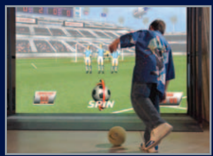
Bend it like Beckham with Visual Soccer! Take penalty kicks, free kicks and test your luck against the world’s finest goalies. It won’t be long before you’re bending it like Beckham!