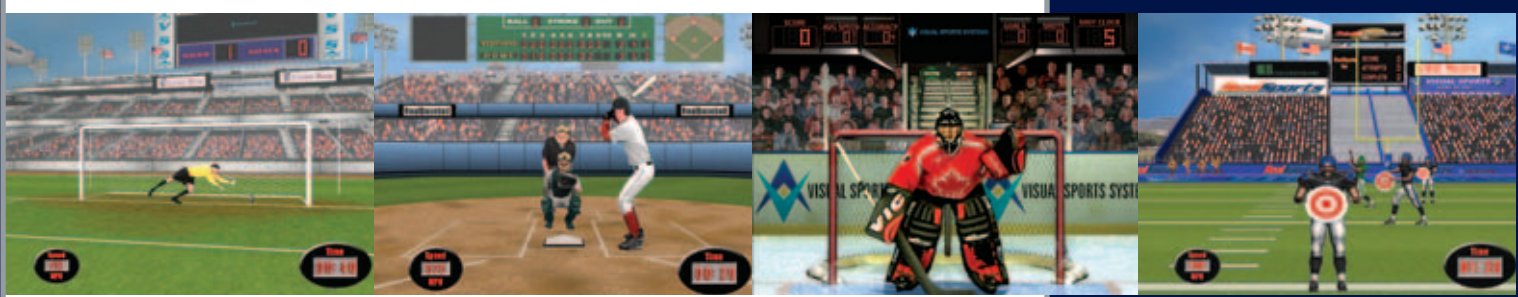
Shown above are actual screen shots of gameplay.